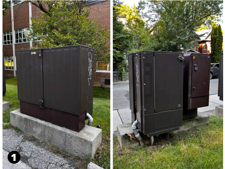
Location: St. Clair Ave. E. + Ferndale Ave. Dimensions: W58" x D27" x H53"